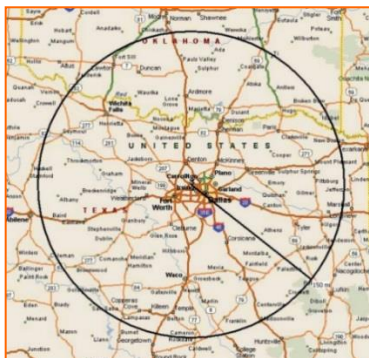
CareFlite Helicopter Service

In addition to CareFlite's air and ground ambulance services, the Caring-Heart Membership benefit is now accepted coast to coast. The benefit is accepted by Air Methods and Halo Flight. See the map below right for the locations currently participating in this reciprocal benefit.