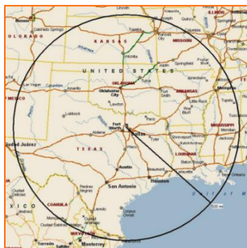
Fixed Wing Air Ambulance Service